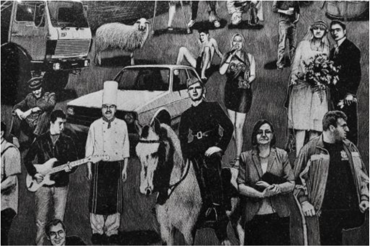
Mladen Miljanović «The Garden of Delights», details.